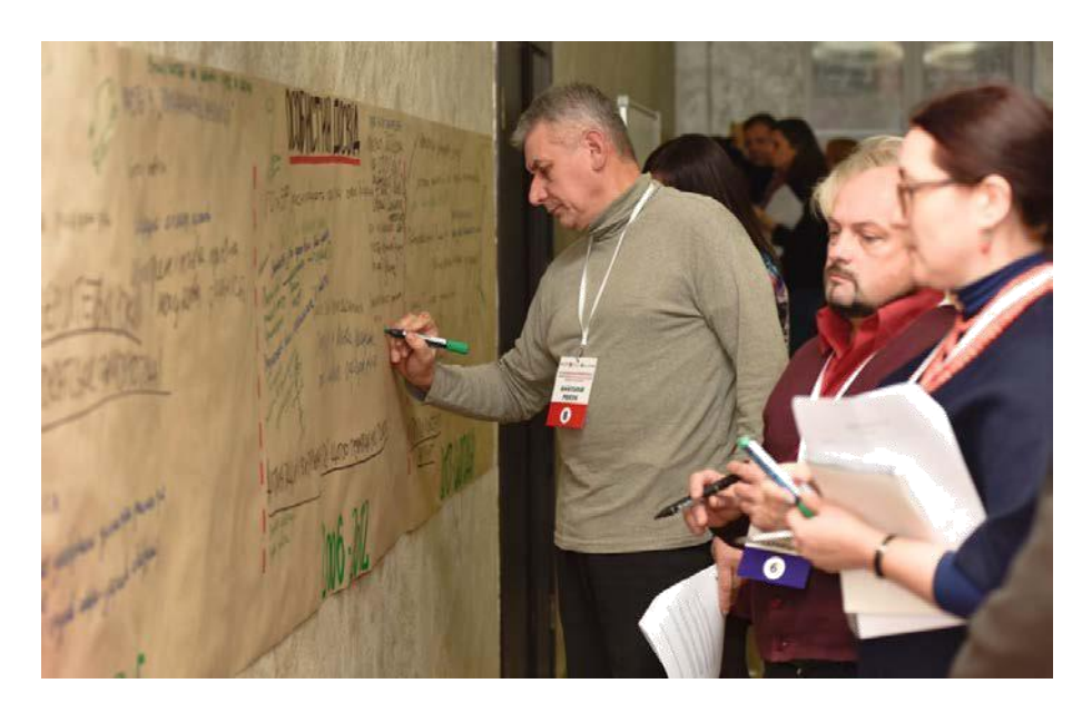
On November 30 – December 2, 2017, GURT has organized the All-Ukrainian Conference "<u>Future of the National Network of Ukrainian Civil Society Organizations</u>" in partnership with NENO and Ukrainian Catholic University where 80 leading CSOs representatives from all over Ukraine took part. For three days, participants wrote a book and created the action plan for 2018.